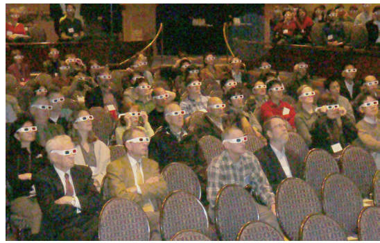
Figure 2. Members of the audience using 3D glasses to view the Visible Ear Simulator presented by Dr. Mads Sørensen from Rigshospitalet and University of Copenhagen, Denmark.

The VES Visible Ear Simulator is based on the “Visible Ear” freeware library of digital images from a fresh frozen human temporal bone, which was segmented and volume rendered into a 3-D model of high-fidelity, true color and great anatomical realism and detail (125voxels/mm 3 ) of the surgically relevant structures. Figure 2 shows the members of the audience using 3D glasses to visualize the models. A real-time rendering was achieved by combining advanced GPU raycasting and standard rasterization. A haptic drilling model was