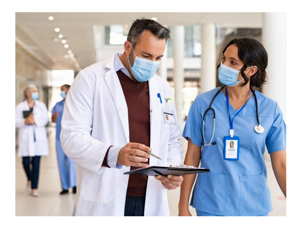
Thank you for choosing Mass Eye and Ear.

Your opinion is important and will help us better serve our patients. After returning home, you will receive a patient satisfaction survey from NRC Health. Please take a moment to complete and return the survey.